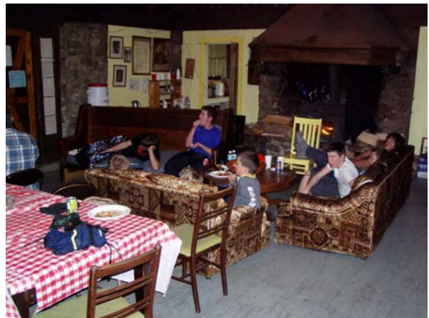
Movies & Popcorn