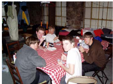
Card Sharks at Work