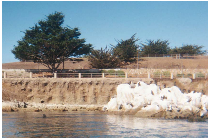
Swimming Seal – Sunning Cormorant