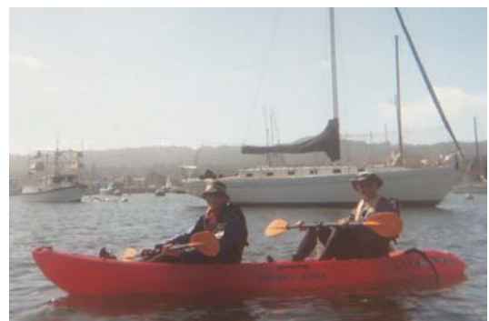
The Surf Riders -- Before...