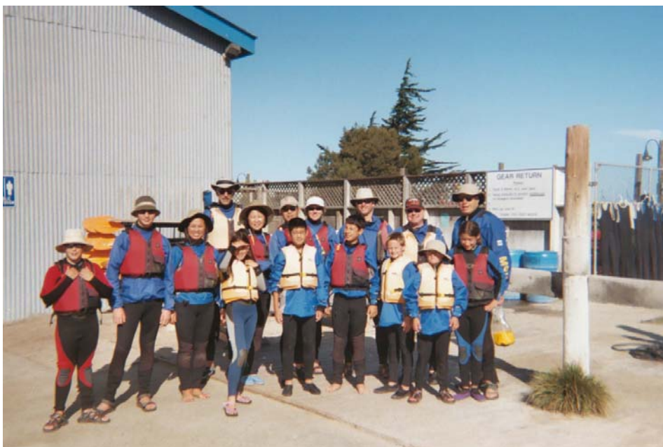
The Crew, Ready for Action!

While the weather all the way from Foster City was overcast and gray, when we hit the Monterey Peninsula, the sky shone a beautiful blue, and it was clear for the rest of our trip. We got there at 9am, just as Monterey Bay Kayaks were opening, and they did their usual efficient job of getting everyone signed in, outfitted, through their training class on into the water. And then the fun began. While it was indeed quite clear and sunny, it was also quite windy, which made for some one to two foot swells! However, that was not to be a deterrent, as everyone in the group eventually made it around the jetty on the far side of the harbor and out into the Bay, some as far as the Aquarium! Wildlife, in the form sea otters, seals, cormorants, and of course sea gulls were plentiful that day, much to everyone's delight. And the waves made for some interesting "landings" on the return, as some unintentionally (really!) surfed the waves in and beached with a bit more speed than intended ☺