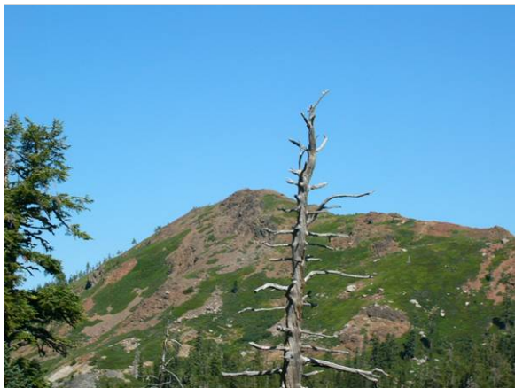
Destination of the older scouts day hike