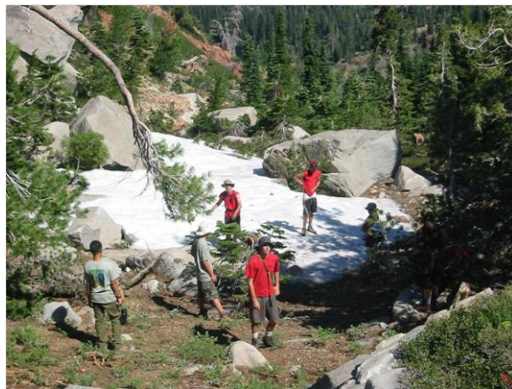
Finding snow on the way there