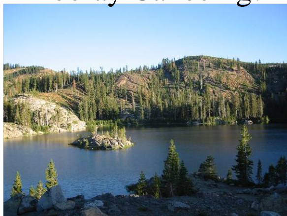
Island Lake, the site for the overnight