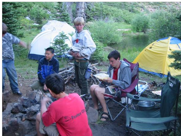
The fire ring/eating area