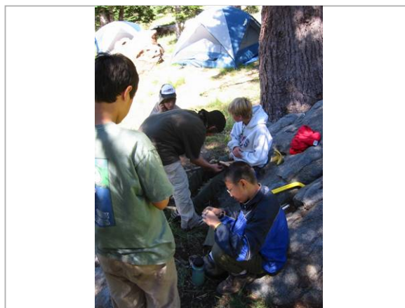
The "middle" scouts teach the younlings lashings.