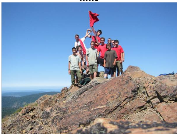
The top of the mountain