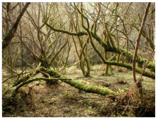
Moss Covered Trees