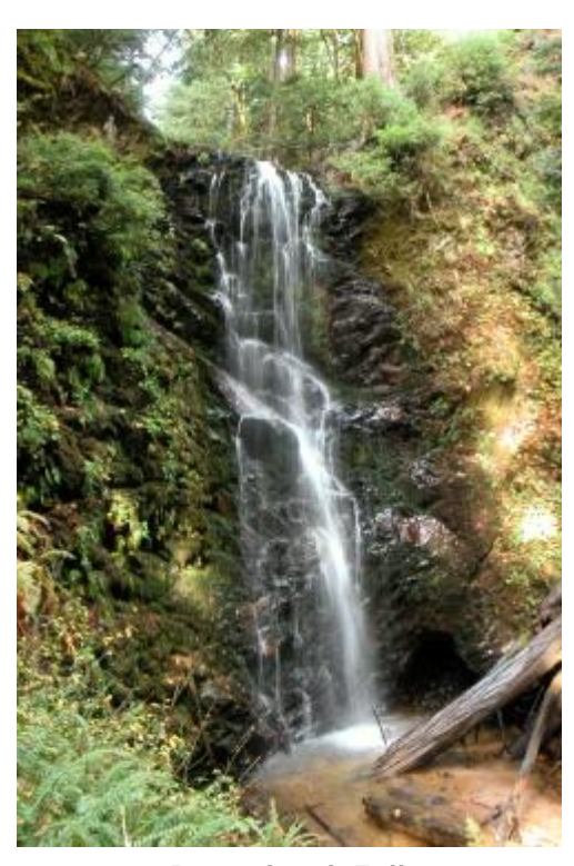
Berry Creek Falls