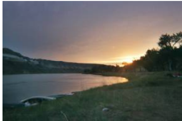
Another Beautiful Sunset