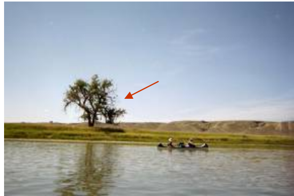
Our First Eagle Sighting