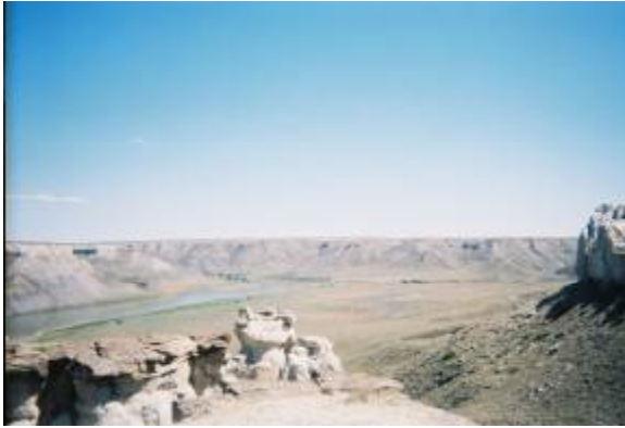
The View from Hole In The Wall

When: Jul 31 – Aug 6, 2004 Where: Upper Missouri River