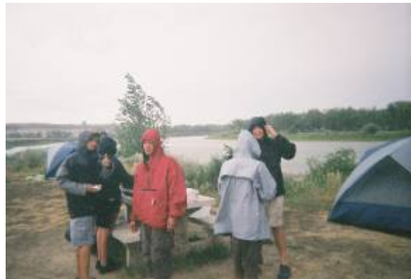
Our First Storm at Wood Bottom