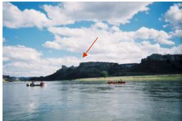
Hole In The Wall