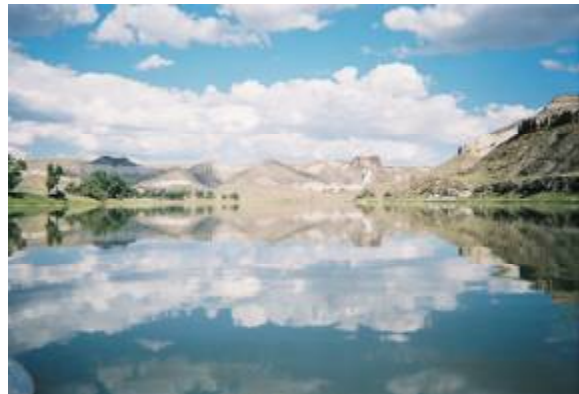
Typical River View