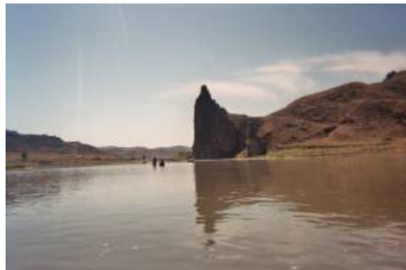
Paddling Past Citadel Rock