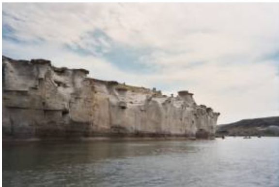
The White Cliffs