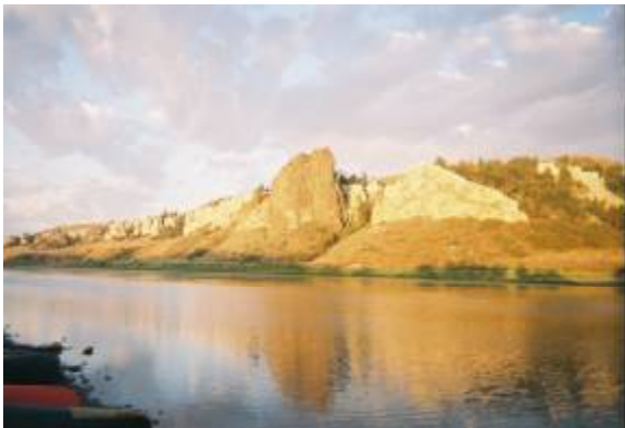
Eagle Creek and LeBarge Rock