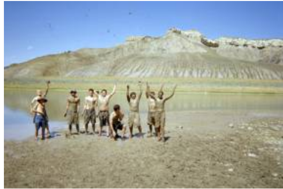
Good Clean Fun