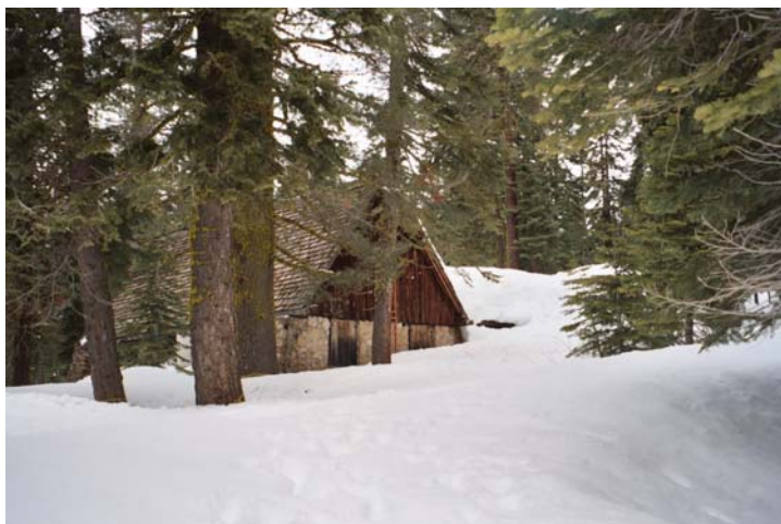
The Hutchinson Lodge

Driving up on Friday night, we hit a bit of snow, but it only lasted a short while. The snow may have made the road conditions less than perfect, but the skiing conditions the next day were perfect! The fresh powder made the snow heavenly and offered a nice padding for those of us who are not expert skiers. Saturday was pretty much full of sunshine. Saturday evening was even better though, when the younger scouts were annihilated by the older scouts during the traditional snow ball fight--that was all good fun. This did bite the older scouts in the rear, however, due to the early waking time on Sunday. The food during the weekend was excellent as usual, with a little dessert surprise due to Nick's birthday. On Sunday, the new snow played an excellent role as the back side of Donner was covered in un-groomed snow that allowed for excellent tree-skiing. In the end though, the sun got the best of the snow and slush was everywhere. On behalf of everybody, I would have to say a good time was had by all and next year the cabin will be packed even more.