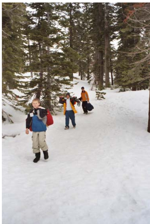
The hardest part is leaving