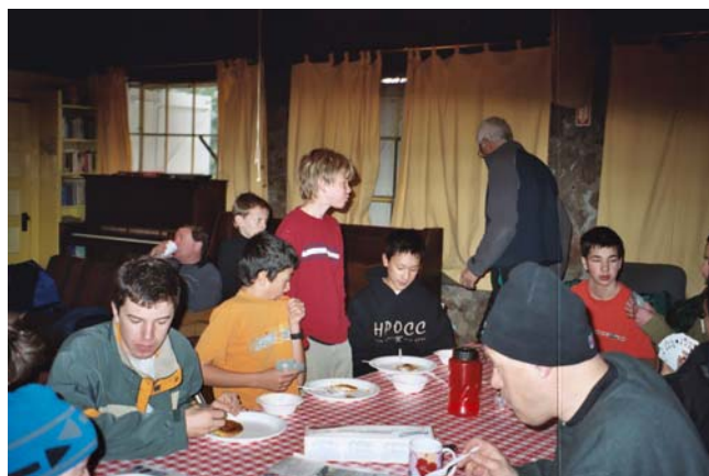
Hot breakfast... mmmm.....