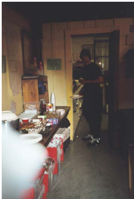
Food: Why we ever got out of bed

When: Feb 25-27, 2005 Where: Hutchinson Lodge Sugar Bowl Donner Ski Ranch