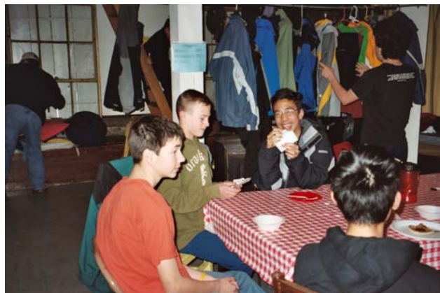
Cards are always the Scout's best friend